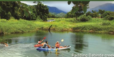
Paddling Babinda creek

RATES: Includes paddle, life vest and pick-up. Minimum of two 2 single or 1 double hire. Half day hire starts at 8am or 1pm.