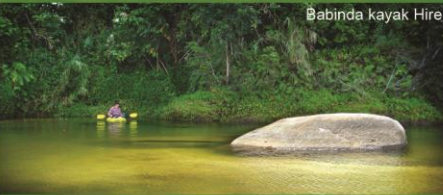
Babinda kayak Hire

How to make the most of your day in Australia's wettest town - (see map over page)